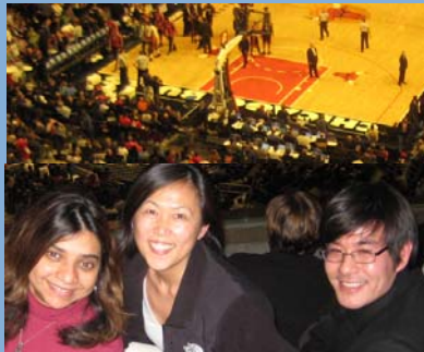
"Close, but no cigar!"